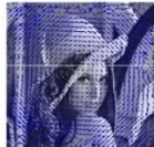
Illustration of optical flow